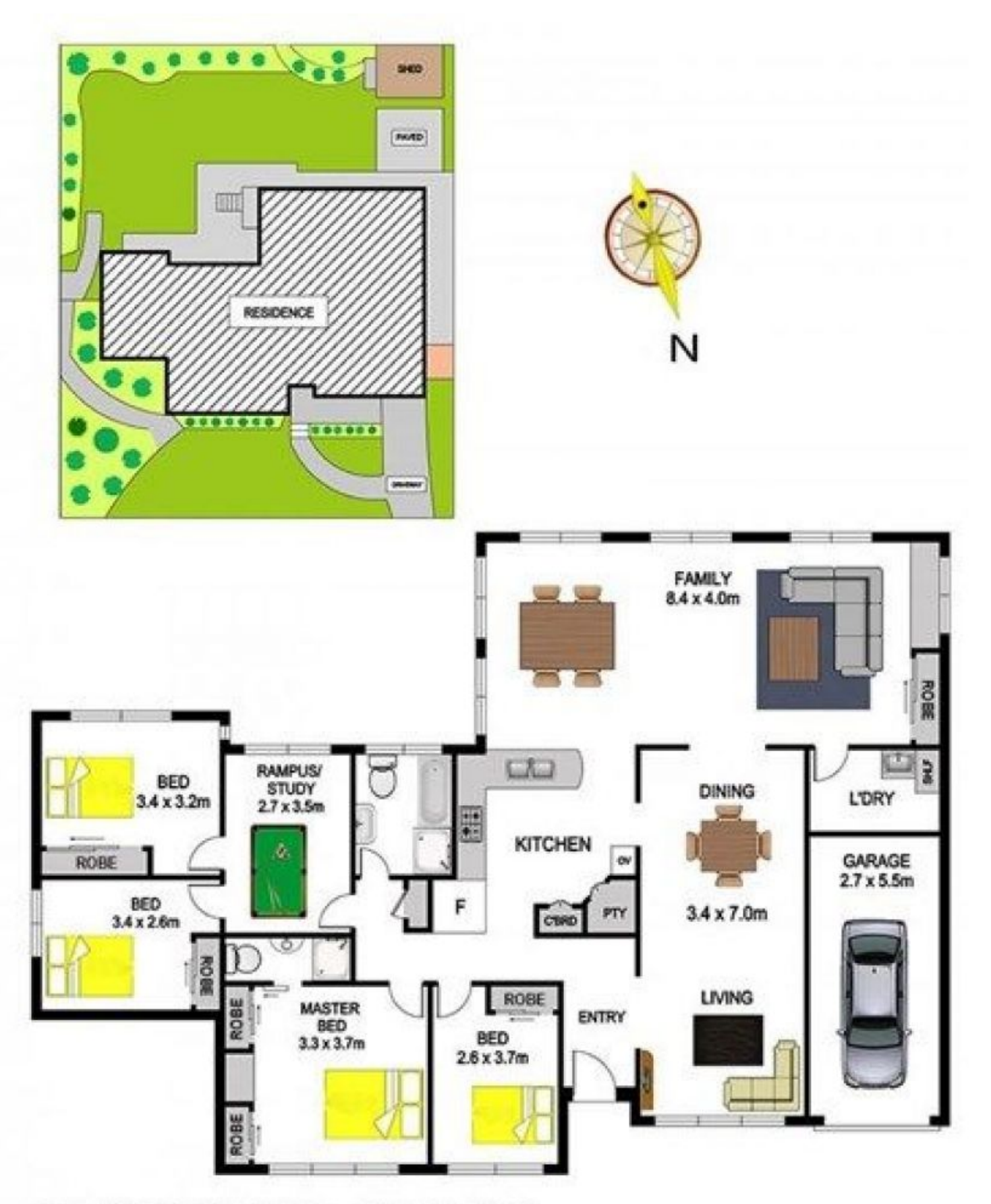
16 ANTHONY ROAD, CASTLE HILL