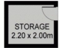
STORAGE 2.20 x 2.00m